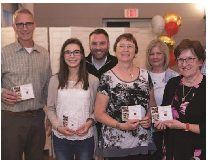
Volunteers receive their pins for five years of service with the Trust.