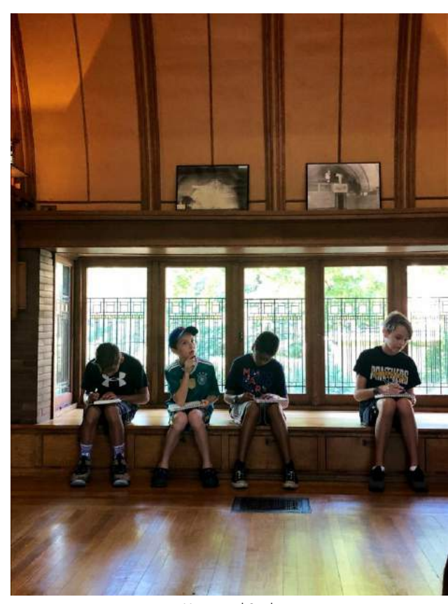
Home and Studio summer camp participants