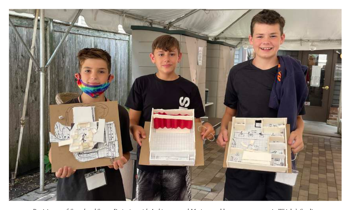
Participants of Sound and Space: Designing with Architecture and Music, a weeklong summer camp in Wright's Studio.