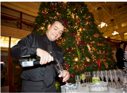
Wright Night at The Rookery Building