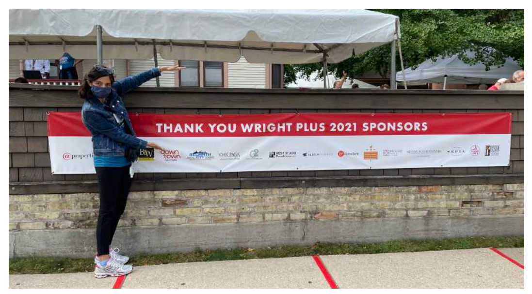
We are grateful to all the Wright Plus 2021 sponsors.