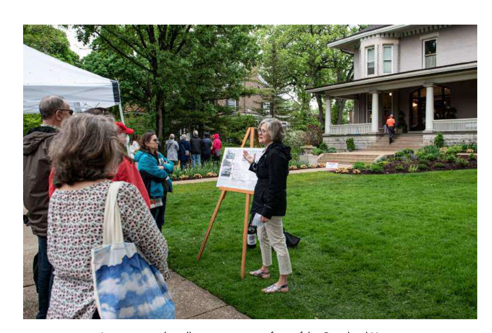
Listening to sidewalk interpretation in front of the Copeland House