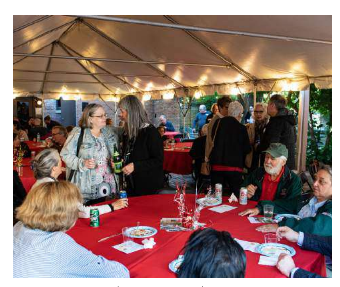
Volunteers enjoying the party