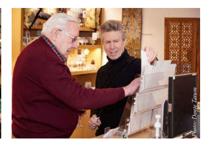
Celebrating Wright Night 2022 in The Rookery Light Court

Tours, education programs, and community events reached 100,000 guests compared to last year's 55,000 in-person site visitation total. During 2022 the Trust's website drew a virtual audience of 500,000.