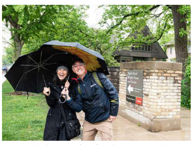
Wright Plus guests in front of Wright's Home and Studio